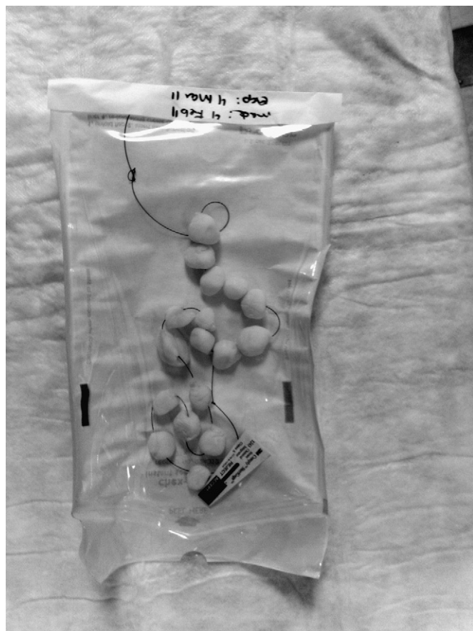
FIGURE 1. Sterilely prefabricated package of antibiotic-impregnated PMMA beads.

The use of antibiotic-impregnated PMMA beads in the management of open fractures and in combat extremity injury is well documented. 5–13 They have been shown to effectively decrease the rate of osteomyelitis in open fracture management, and to be an effective adjunct in the treatment of chronic osteomyelitis. They have also been shown to be a cost-effective adjunct in the management of open fractures, with an average cost of $419. 12 Antibiotic beads have also proven to be helpful in the management of extremity blast injuries, 5,6 and have been used both in conjunction with NPWT and in bead pouches. In applying these two techniques, the method by which antibiotic beads are prepared